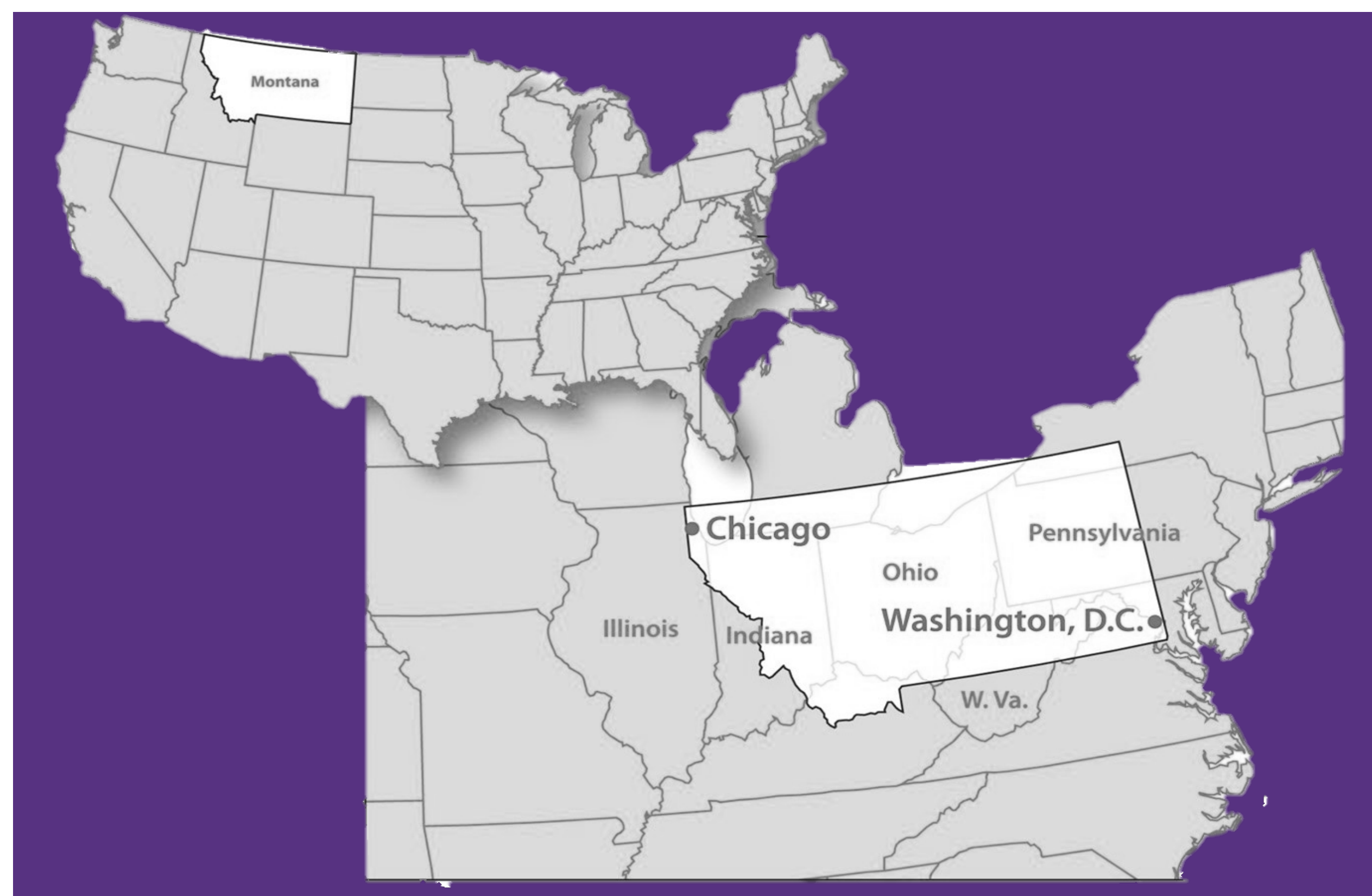
147,040 sq. miles (3 rd lowest population density in the United States [6.86 people/sq mi])